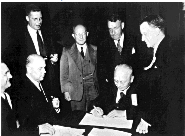
The Signing of the LWF Constitution