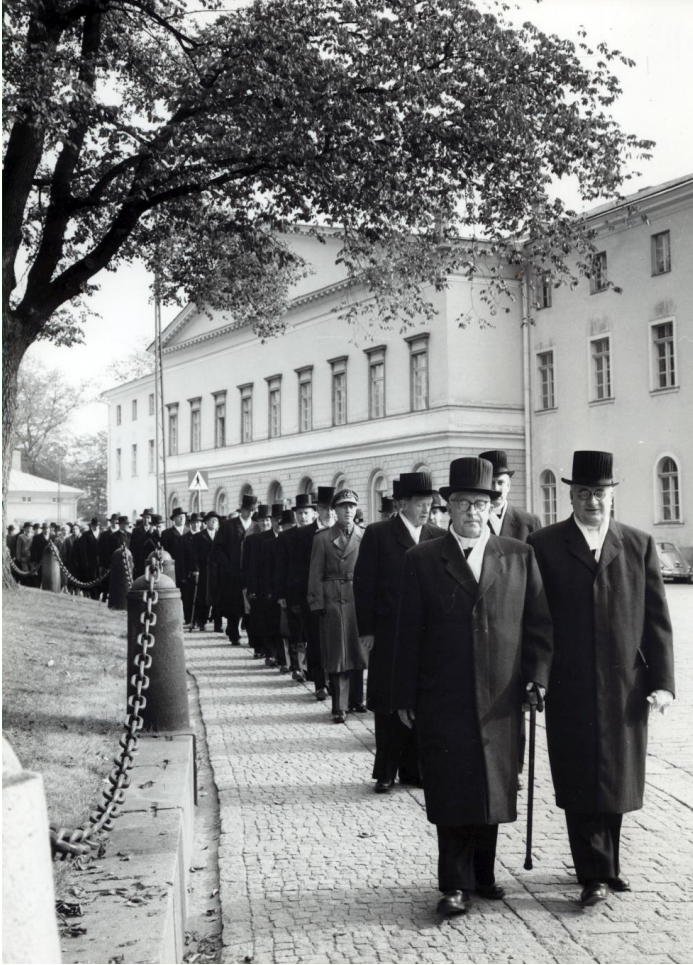
Members of the Lutheran Assembly moving in a procession

Place: Helsinki, Finland Dates: 30 July-11 August 1963 Theme: "Christ Today"