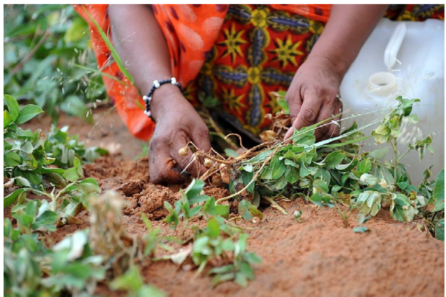
A woman tends a MARCOL training garden in Mberra camp, Mauritania. Thanks to the program Malian refugees produce more vegetables and the price of vegetables in the market has dropped.

“It was quite difficult to convince people that they could grow vegetables here,” LWF project coordinator Papa Diallo recalls. During the day, the tempera-