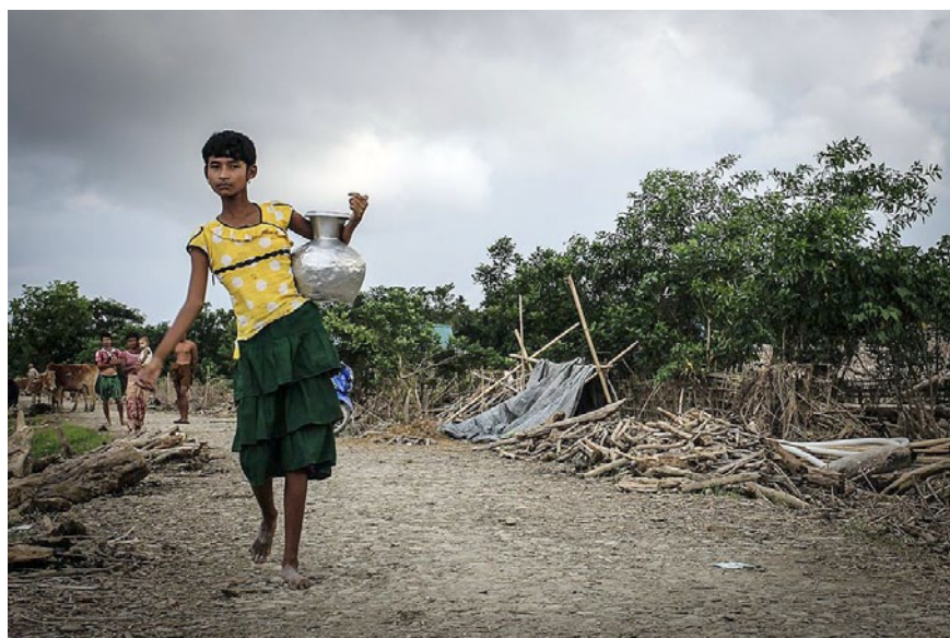
A woman walks down a street in Myanmar, where women are particularly disadvantaged. The LWF has presented recommendations to the UN human rights process which will scrutinise human rights in Myanmar.

The reasons for this are mostly traditional customary laws and practices, whereby land is inherited, exchanged