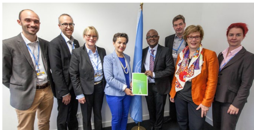
Joint faith and spiritual leaders present statement to Christiana Figueres, Executive Secretary of the UN Framework Convention on Climate Change.

On 16 October, the general secretary wrote to the LWF member churches urging them to increase their advocacy on climate justice with their governments in the buildup to the Paris summit, as “climate change is a matter of urgency and a matter of justice.” He reminded them that the LWF has for many years highlighted that climate change is a critical intergenerational issue, and warned that ecological degradation particularly hits the poorest communities.