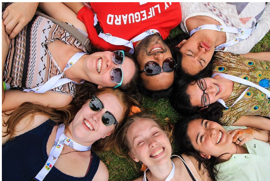
Young Lutherans: excited about the prospect of launching Living Reformation projects.