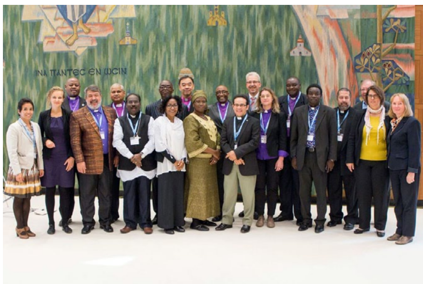
Participants of the “Induction of Newly Elected Leaders” pilot project, at the Ecumenical Center in Geneva.