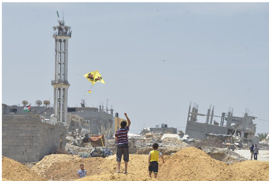
The LWF is among ACT Alliance members condemning deaths, housing demolitions and destruction in Palestine and Israel, including Gaza.

www.lutheranworld.org/sites/default/files/act_palestine_forum_statement_0.pdf