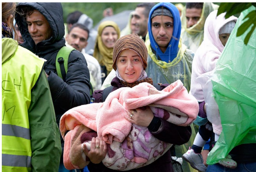
A refugee carries a child near the Serbo-Croat border.

In Šid, Mészáros noted that a good relief system is in place, providing for the needs of thousands of refugees every day and guiding them on their way. “I had already been to Röszke and the Keleti railway station in Buda-