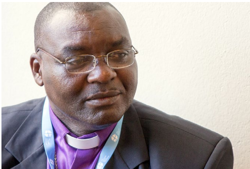
Churches in the Central African Republic strive to help warring factions reconcile, says newly elected president of the Evangelical Lutheran Church of the Central African Republic, Rev. Dr Samuel Ndanga-Toué.

The United Nations High Commissioner for Refugees estimates