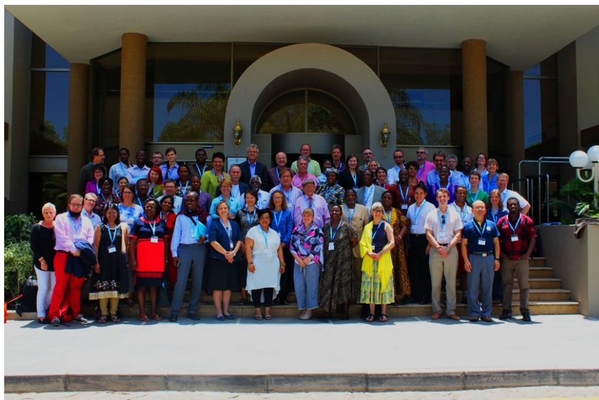
Participants at LWF's conference, "Global Perspectives on the Reformation" in Windhoek, Namibia.

ing relationships with the communion enable us to see reality through others' eyes," they said.