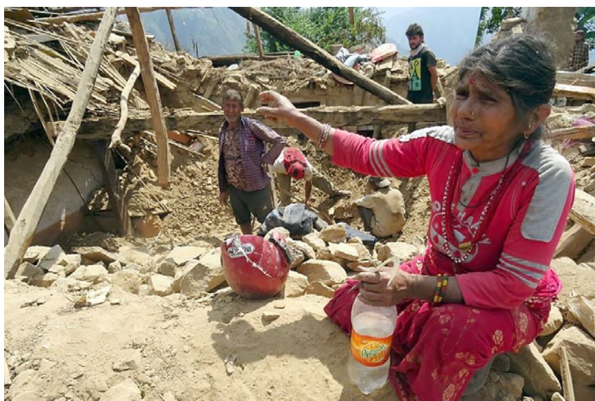
After the earthquake in Nepal, local villager searches for cooking utensils in the debris.

Junge said he was pleased the LWF offered a channel for the church in Malaysia to express its diaconal concern for the people of Nepal. He