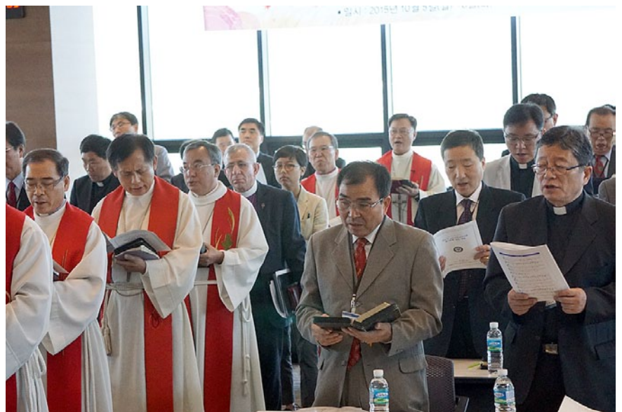
LWF President Bishop Younan joined congregation members in a church service in South Korea. He condemned the division between the two Koreas, saying walls incite hatred.