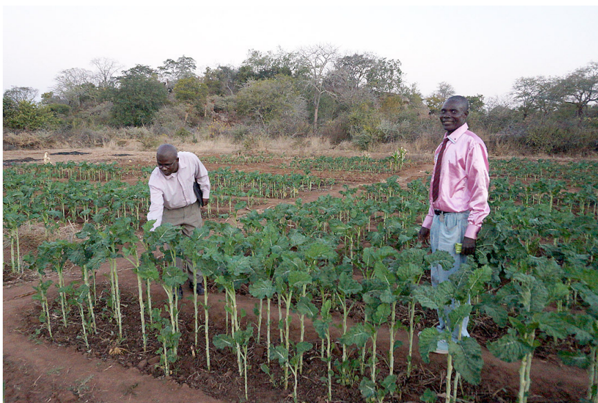
An income-generating garden for people living with HIV and AIDS in Musume, Zimbabwe.

In addition to the LWF, the Church of Sweden and Evangelical Lutheran Church in America fund the project. The sub-regional Lutheran Communion in Southern Africa (LUCSA) AIDS program also provides capacity building support and is involved in a related awareness project for young people.