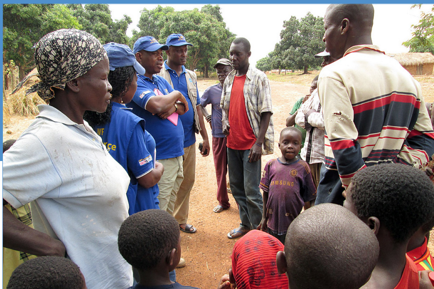
LWF emergency response staff meets with IDPs in Bouar in Central African Republic's Nana Mambéré prefecture.

New Coping Skills despite Slow Recovery from Drought in Southern Angola ..... 18