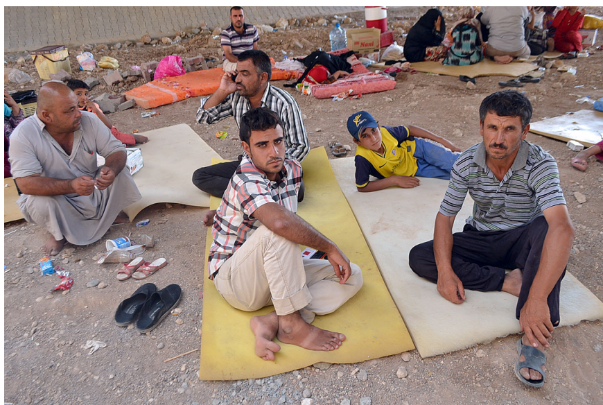
IDPs in Dohuk, Iraq.

Together with its partners in the ACT Alliance, the LWF works to ensure clean,