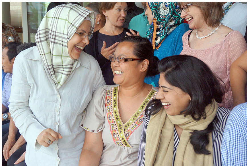
Participants of the Seattle Interfaith Conference discussing reform and renewal in different religious contexts.

religious communities, participants urged the religious leadership to oppose the use of violence in the name of religion and instead to strengthen values of dignity, compassion and solidarity.