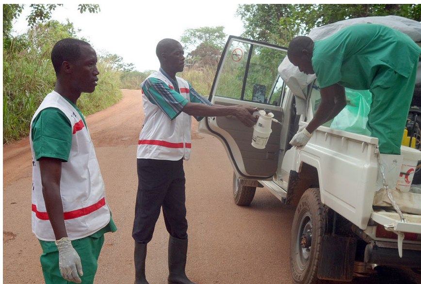
Increased efforts are needed to prevent the spread of this biggest Ebola outbreak ever recorded.

Through the Lutheran Development Service (LDS), the Lutheran Church in Liberia and ACT Alliance, the LWF is seeking additional funds to expand life-saving public awareness and prevention programs in Montserrado County, and in Bong, Lofa, Gbarmpolu and Grand Cape Mount counties along the Guinean and Sierra Leonean borders. The LWF also plans to acquire an isolation center for the Phebe Hospital and School of Nursing Compound.