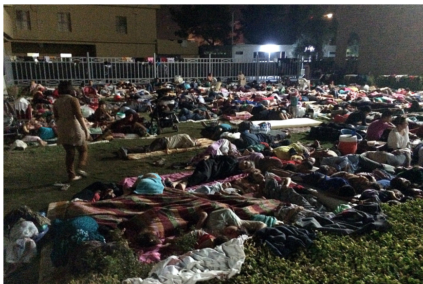
People displaced by the conflict take shelter in community buildings in northern Iraq.

According to data from the United Nations, about one million people have been displaced by violence and insecurity since the beginning of the year. The militant group Islamic State (IS) is especially targeting minorities such as Yazidis and Christians. The LWF together with partners from the ACT Alliance has started emergency