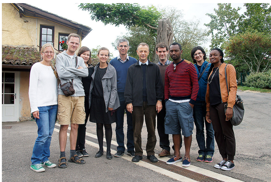
Young Reformers Steering Committee at Taizé.

For these celebrations, the community has also invited young people to discuss ways of engaging in the