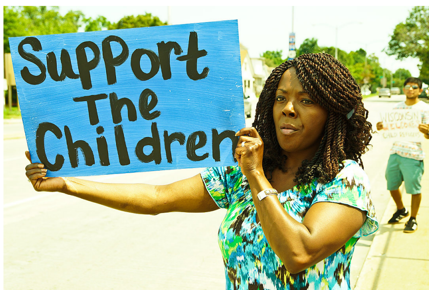
Rally in Wisconsin against deportation of children, July 2014.

"The unaccompanied children that migrate are in search of life. The El Salvadoran Lutheran Church collaborates in emergency aid through long-standing pastoral support," he said. "We are blessed that most of the churches in the region are organized to offer pastoral support through networks built with ecumenical organizations and civil society. It is my hope that governments will participate in the response to the crisis as well."