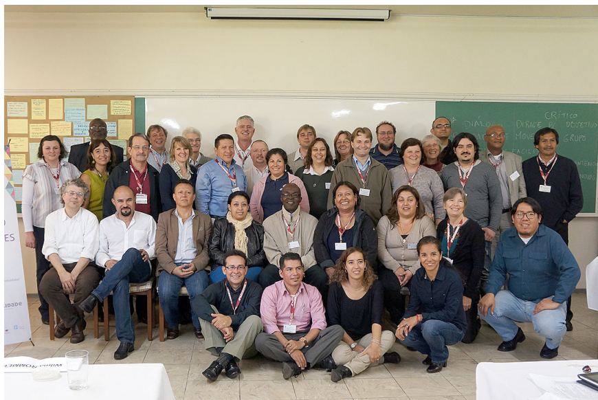
Participants at the LAC sustainability meeting.

The meeting emphasized the prophetic mission of churches in promoting and providing opportunities to ensure sustainability as well as allowing for change and healing. Fifty percent of churches in the region have started participatory strategic planning (PEP) to help define their vision, mission, objectives and strategies in coming years.