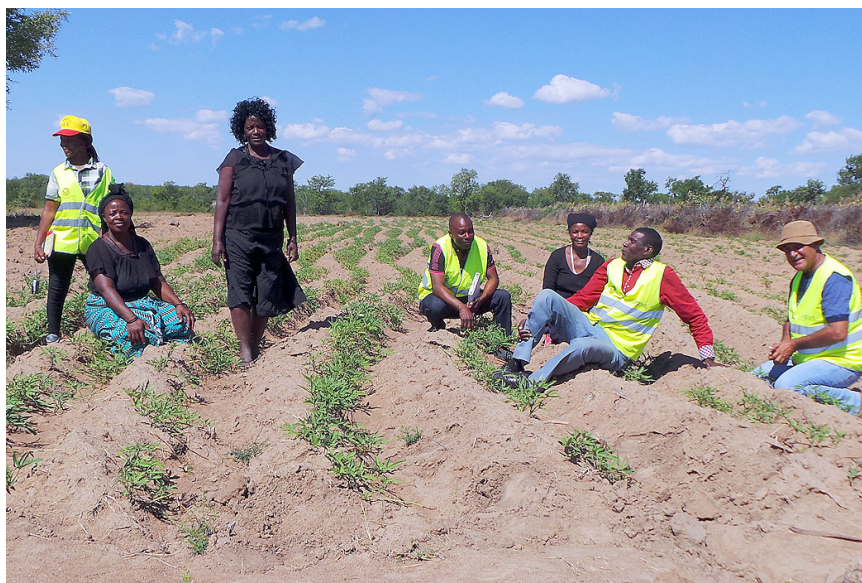
A demonstration farm for drought-resistant sweet potatoes in Gambos municipality, Huila province, southern Angola.

Today, she is grateful for the drought response assistance—maize meal, beans, cooking oil and salt—coordinated through the LWF Department for World Service (DWS) Angola program. “Thank God we have passed through the critical period. Without this help, I