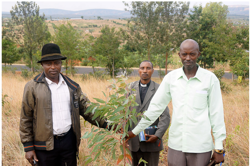
Tree plantation in the Matimba parish of the Evangelical Lutheran Church in Rwanda.

“I want to thank my parish leaders for making me aware about joining a group for saving and lending as it restored