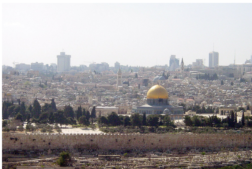
Jerusalem.