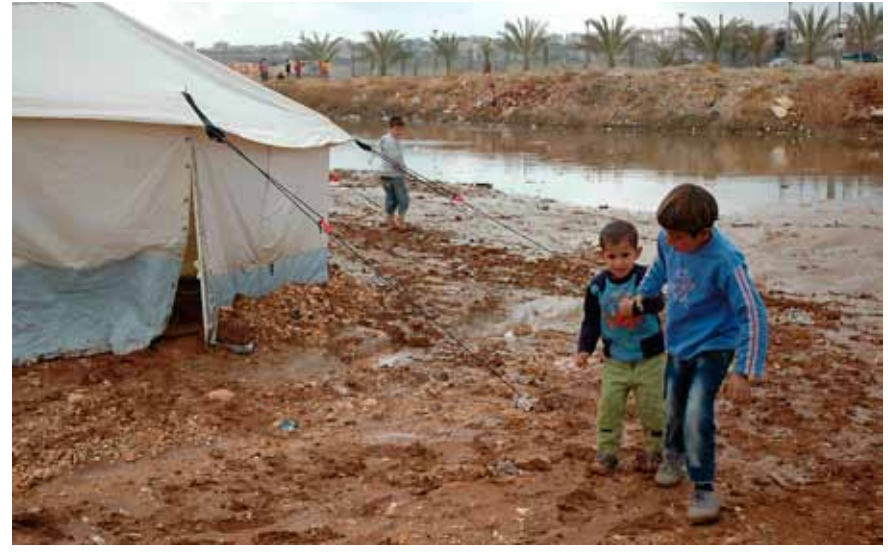
Children walk near flooding in tented settlement Jordan.

By December, an estimated 2.3 million refugees from Syria were living in neighboring countries and another 6.5 million people had been internally displaced since the current conflict began in March 2011.