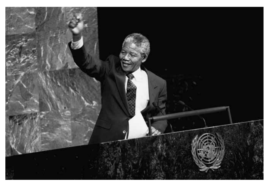
Mandela addresses the UN General Assembly in 1990.

In the following years, tension between the Assembly call and the reality within Southern Africa was discussed. At its Seventh Assembly in Budapest