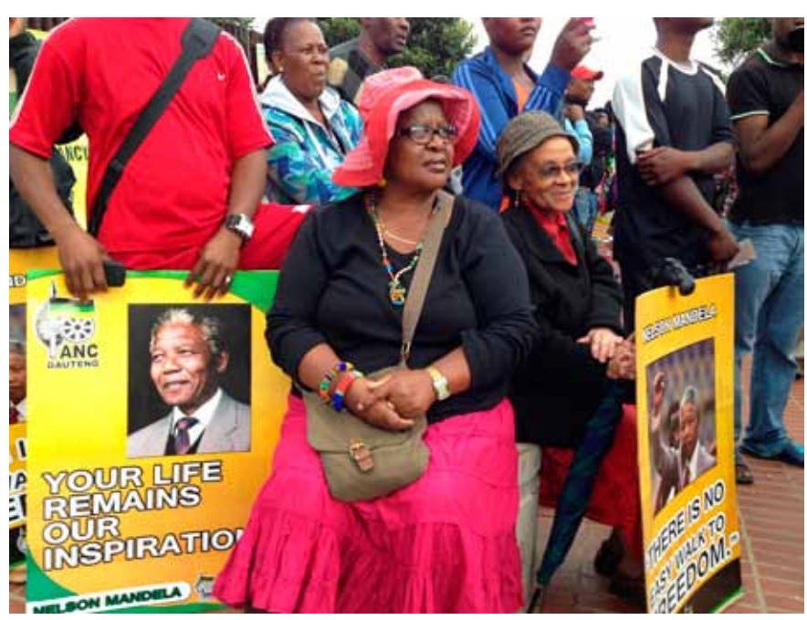
Tributes to Nelson Mandela in Soweto, South Africa.

"He taught the white South Africans—indeed all South Africans—that all have a place in the new South Af-