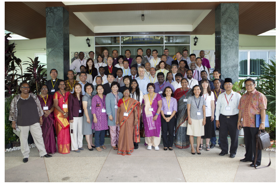
Participants at the Asian Church Leadership Conference in Bangkok, Thailand © Bernard Riff

"There is strong leadership provided by the LWF Asia desk and the Asian