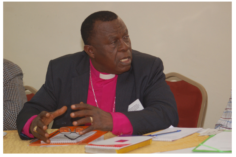
Ghanaian Bishop Dr Paul Kofi Fynn, moderates one of the sessions at the LWF consultation on "Confronting Poverty and Economic Injustices in Africa" held in Nairobi, Kenya.

The LWF church representatives also discussed the widespread practice by African governments to lease "so-called unproductive land" to multinational companies to cultivate food or cash crops for export under the guise of creating local employment opportunities and generating government revenue. This new development will further impoverish the communities and deprive them of land—their key source of livelihood, the task force members emphasized.