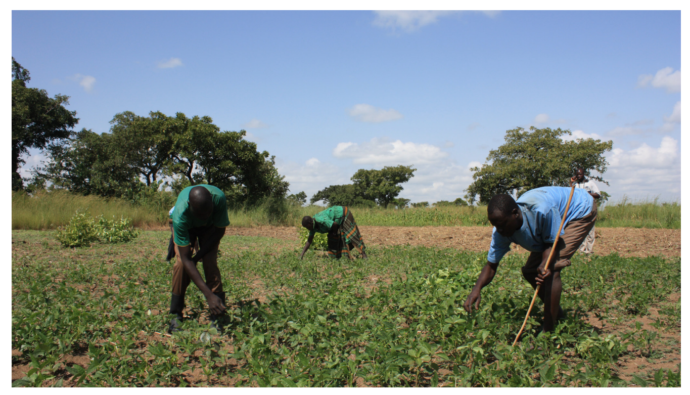
LWF's work among communities in Pader district, northern Uganda, includes support to farmers to increase food productivity.