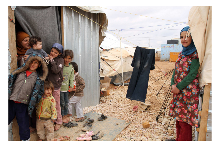
Children in the Za'atri refugee camp play outside their newly installed winterized shelter.

donor, the Czech Republic, while congregations of the Evangelical Church of Czech Brethren (ECCB) gave more than EUR 10,000.