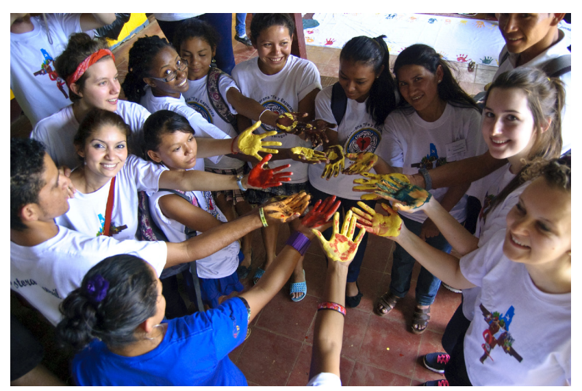
At the "Green Project," the LAC and Nicaraguan youth get ready to become artistic advocates for the environment.

Participants drawn from 13 LWF member churches in the LAC region spoke of their local involvement in