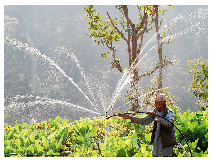
Irrigation improves food security for 70,000 refugees and host communities in Nepal.

Although the Bhutanese refugee population declined from 110,000 in 2006 to around 54,000 in December 2012 due to large-scale departure