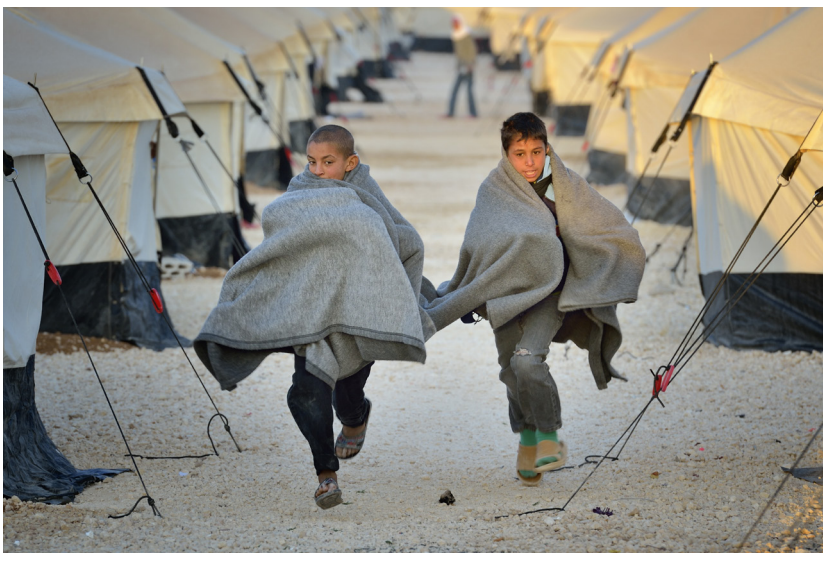
Boys run amid the tents in the Za'atri refugee camp.

(LWF Jordan program staff contributed to this article.)