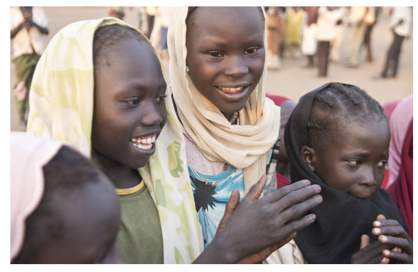
Girls sing and clap at the camp where the LWF runs two schools.

But modern life and conflict are weakening this tradition. "The extended family is a bit weaker now, because people see themselves as individuals," she says, adding that poverty also forces parents to look