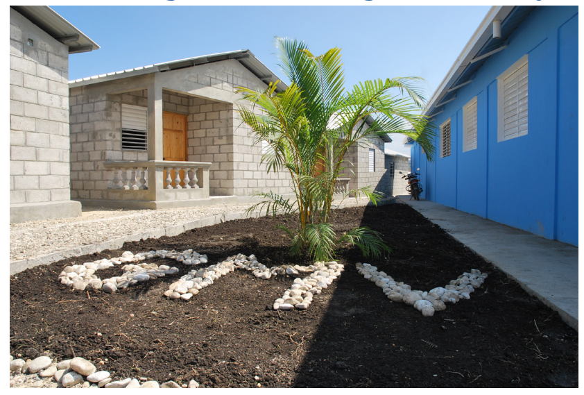
The LWF model village provides dignified housing and shared facilities for families who lost their homes in the January 2010 earthquake.

It is all part of LWF's contribution to the country's recovery, noted Perolof Lundkvist, LWF representative