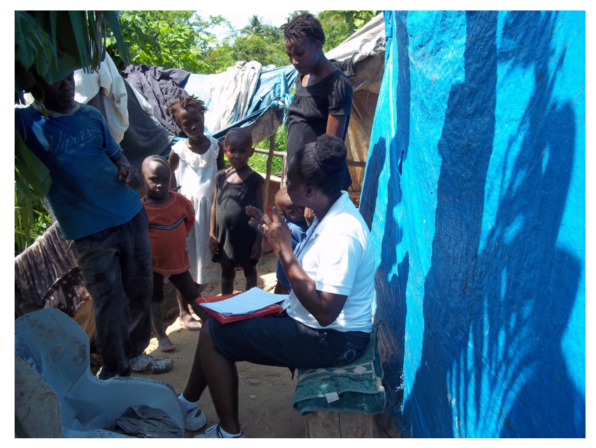
The selection process for potential home owners included interviews with displaced families.