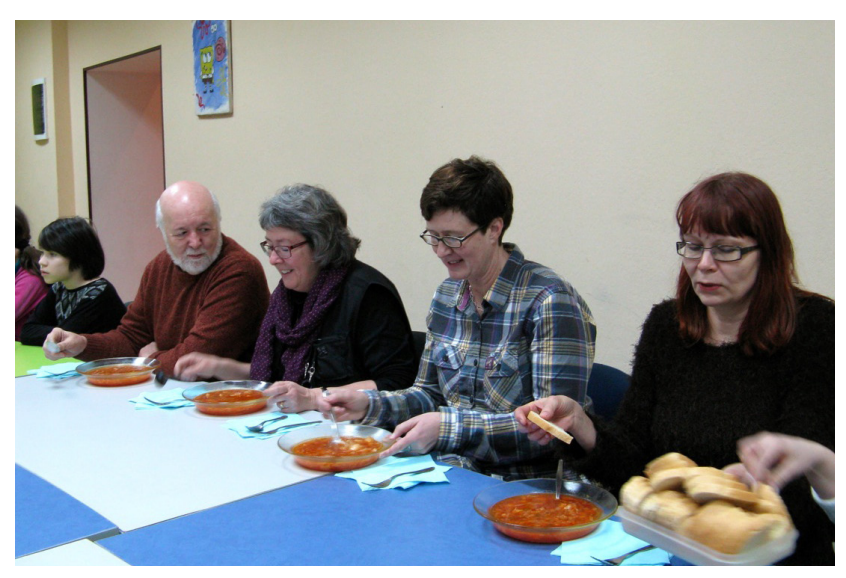
Learning about diaconal work in Odessa included sharing a meal with children at the Living Hope day-care center.