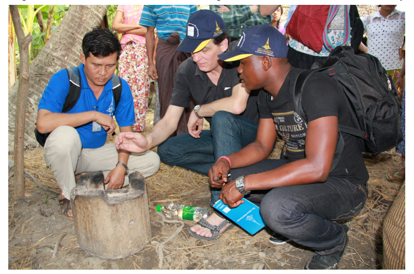
Members of the LWF Committee for World Service and a local staff person observe a fuel-efficient stove made from local materials at Ab Si Ka Lay village, southern Myanmar.

In a country that is prone to flooding, the World Service program works