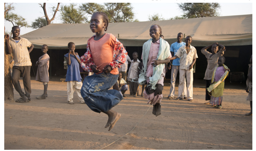
A space to play; girls skipping rope at the camp.

Simply put, they are places where children can play together safely. Af-