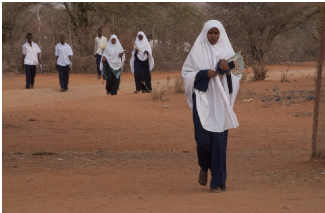
Students on their way to school in Hagadera camp.

if the current trend continues, there will be equal numbers of boys and girls enrolled in the Dadaab schools within the next three years. This is, in part, due to a campaign funded by the World Food Program, which gives sugar tokens to girls who attend 80 percent of classes every month.