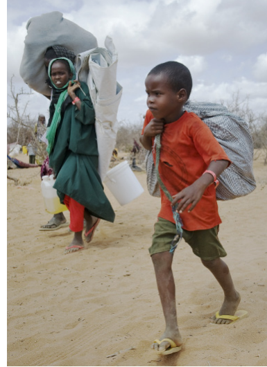
Children move to a new camp close to Dadaab

They have lived on the outskirts of the camps for a month and five days. In 2011, over 100,000 people poured into Dadaab, fleeing from drought and violence in Somalia. Some stay with relatives or other families from their clan, but many pitched their tents on the outskirts and stayed there. These tents sat on sandy orange dirt, a long way from water and other amenities.