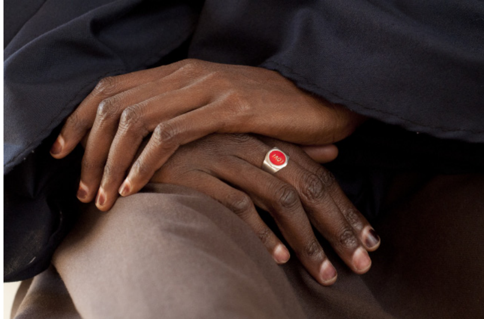
The hands of a victim of domestic violence

The massive influx of refugees in 2011 put additional pressure on the system. Land encroachment increased as new arrivals settled on areas designated for refugee facilities. Disputes and assault cases both increased according to Amina, one of the female leaders in the camps.