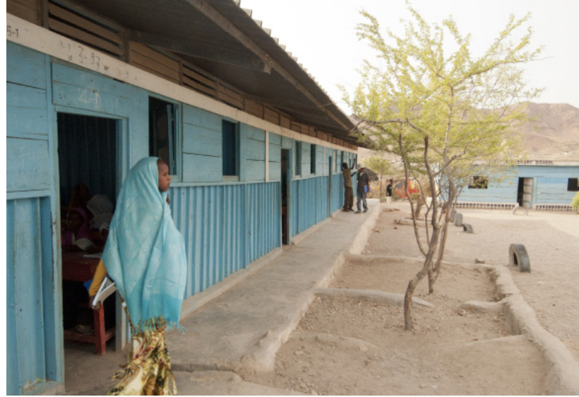
Going to class at Wadajir Primary School in Ali Addeh Refugee Camp

This poses significant challenges to the school system in Ali Addeh. Students can only go to Djibouti Secondary Schools if they use the