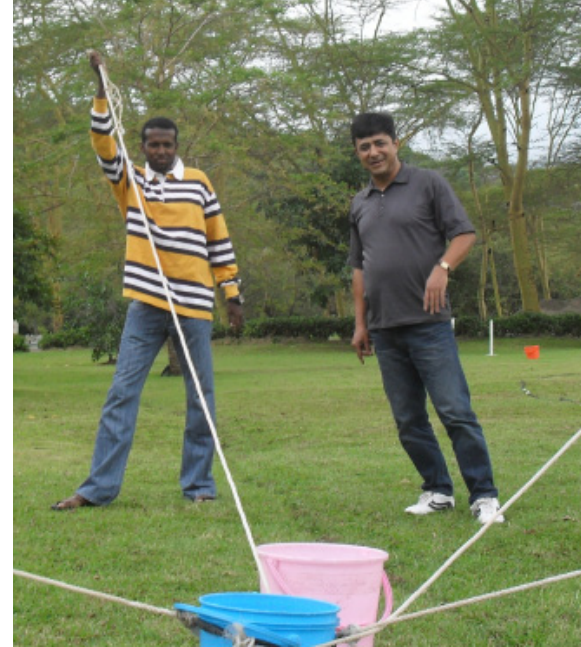
LWF staff at a finance workshop, teambuilding and problem solving

But the workshop wasn't all hard work. The first session was spent team building and saw the Finance staff grappling with ropes and buckets outside the venue. Although it may seem like innocent fun, exercises like this help build relationships within the finance team.