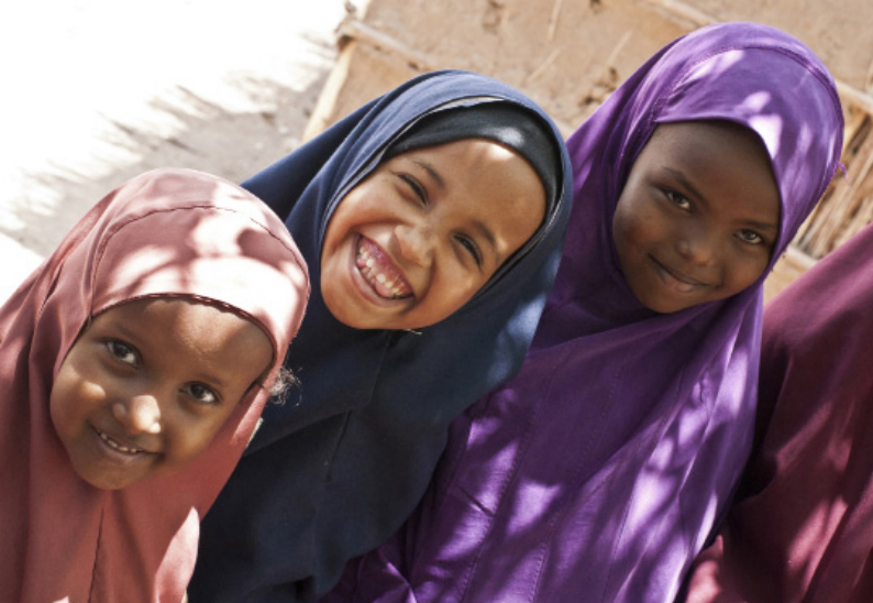
Three young Somali refugees in Kakuma