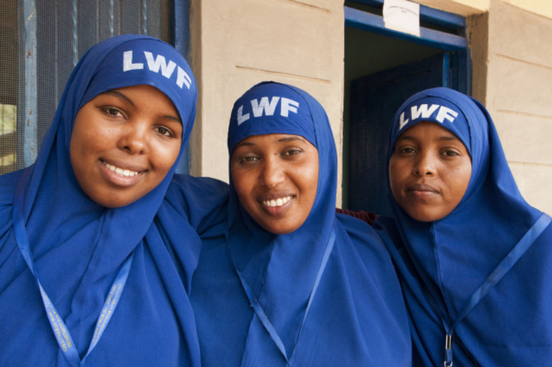
Community police in IFO camp, Dadaab

“It’s working very well, and all the other agencies here now factor these teams into their work.”