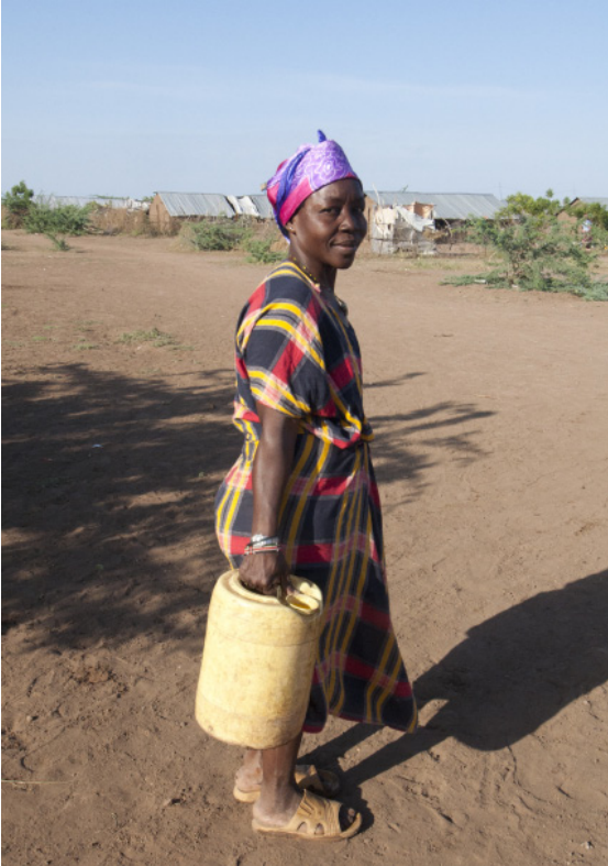
A woman with water collected from a tap stand in Kakuma

stretched, this pushes them even further.