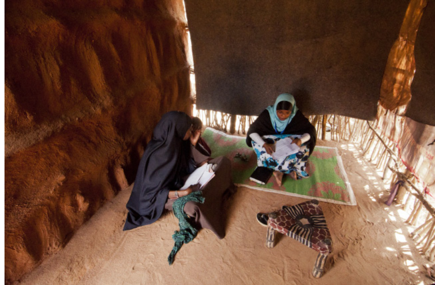
An LWF Social Worker reviews a protection case

The Teams which are managed by The Lutheran World Federation (LWF), will now be extended. After their month-long training, which begins this week, they will make up new Teams in the new camps that have opened in response to the new influx. Their job will be to keep the camps safe for refugees escaping drought and insecurity at home.