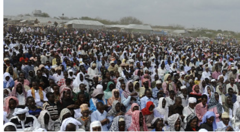
Muslim men gathered in Dadaab on the morning of Eid

The only ones who didn't feel the same sense of anticipation was the small herd of goats tethered outside the kitchen. Traditionally, food is gifted at the end of Ramadan so that everyone can celebrate Eid and, throughout Dadaab, goats were slaughtered to mark this tradition.