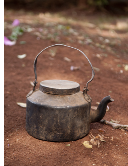
The sooty kettle

Humanitarian support may never fulfill all their needs, but we can at least provide the basics as well as boost their own capacity.