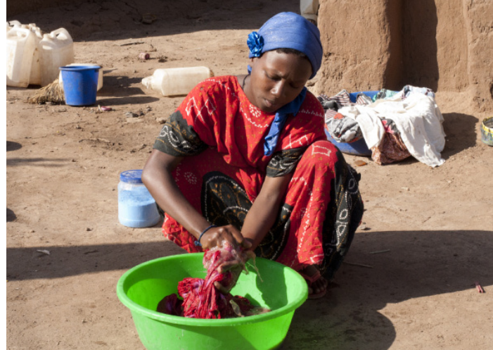
A young woman washes clothes in Kakuma

In the past girls in Kakuma Refugee Camp schools were reported to miss classes during their menses while women skipped meetings and other community engagements during this critical time of the month. LWF makes provision for sanitary wear for girls and women of reproductive age with funds from UNHCR, LWR/BPRM and Danish Church Aid/DANIDA. The objective is to boost their confidence and improve their hygiene during this critical time. This enables them to participate in camp activities throughout the month uninterrupted. There are 4984 girls between the age of 10 and 25 in two secondary schools and 14 primary schools who benefit from four cycles of sanitary distribution in 2011.