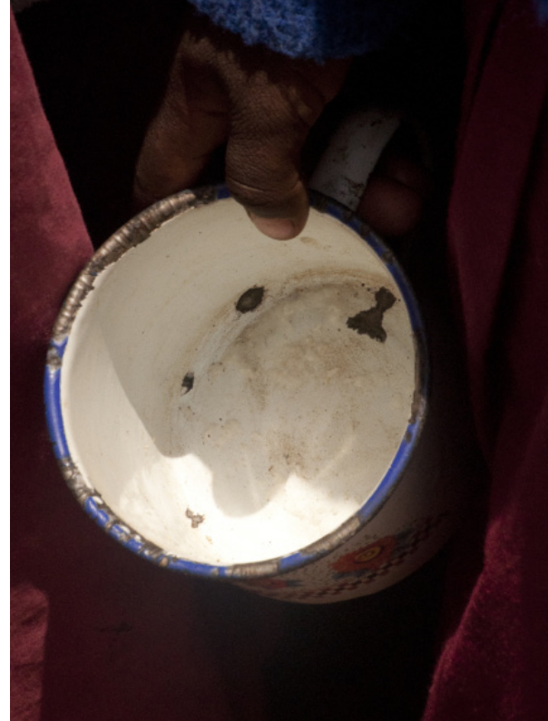
A child holds a cup in a school feeding program

I am in my final semester and will finish my engineering degree in June 2012. After that I hope to return to South Sudan to build a school and library in my village. In the future, I want to work for a charity organization that helps our people achieve what I have. The reason that I am studying electrical engineering is because I want to help build my country.