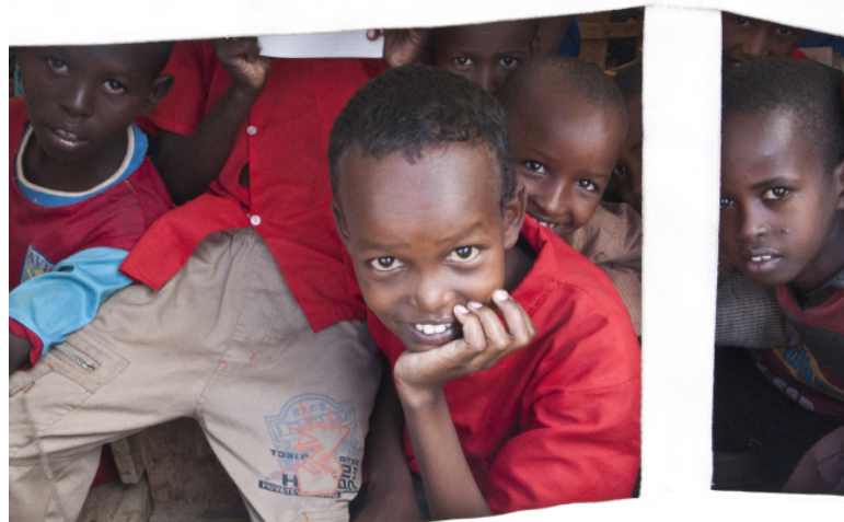
Students in a tent that serves as a classroom in Dadaab.