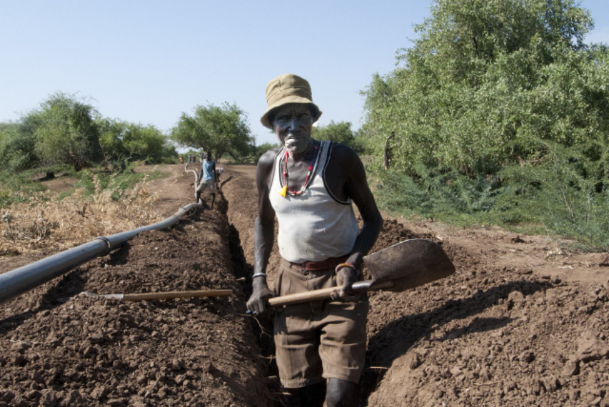
Digging trenches for new water pipes in Kakuma.