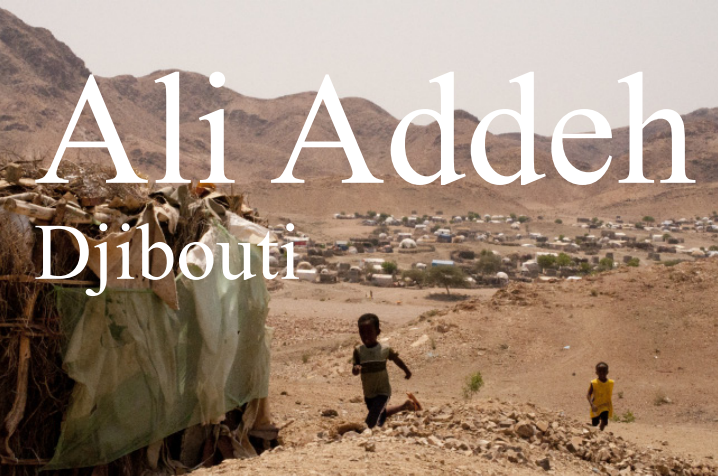
The refugee camp near Ali Addeh, Djibouti

After managing the refugee camp near Ali Addeh, Djibouti for two and a half years preparations to open a second camp were at an advanced stage by the end of 2011. LWF has been operating education and livelihood programs in Ali Addeh and will do the same in the new camp at Hol Hol.