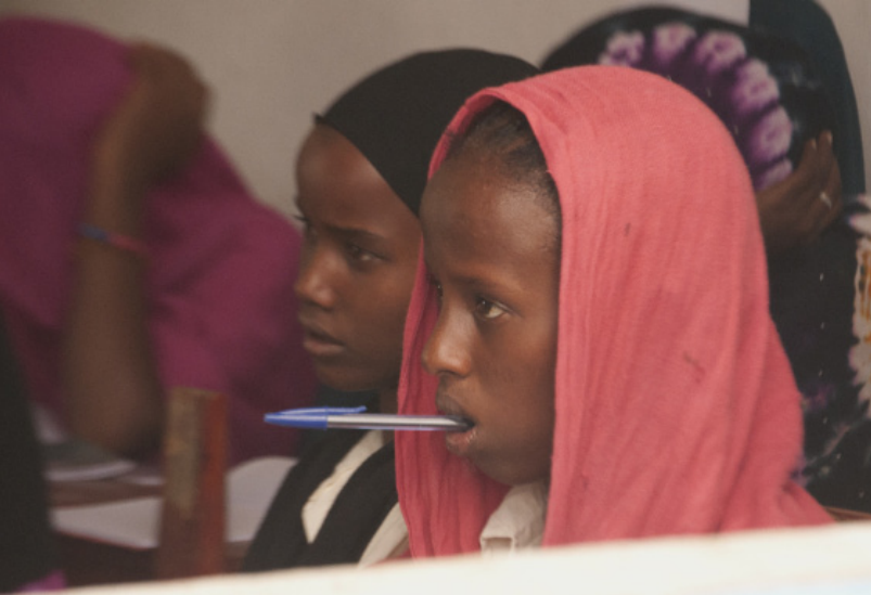
Girls in a class at Wadajir Primary School

There are also very few trained teachers among the refugee community and a high turnover among the teaching staff who are trained. LWF is forming a partnership with a National Teacher Training Centre in Djibouti to second local teachers to the camp.