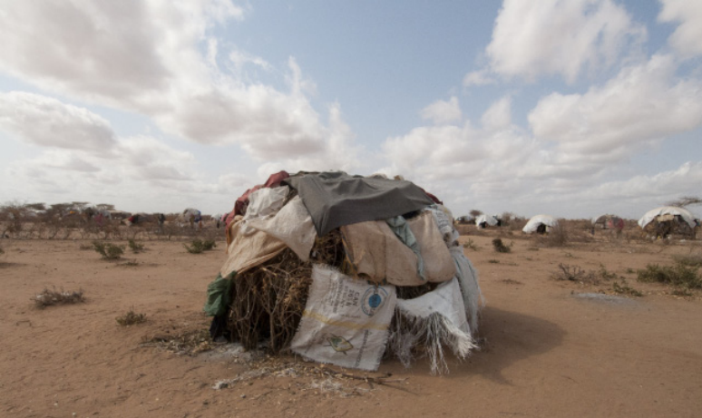
The home of one of the hundreds of thousands of refugees who arrived in Dadaab in 2011

This included setting up section posts inside the camps that enabling social workers and members of the CPPTs to be within reach of the vulnerable people who needed their services.