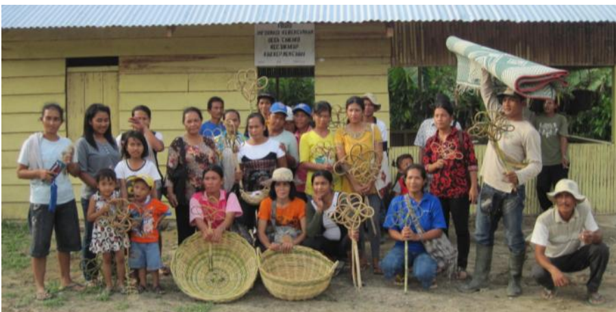
Taikako Youth Group was posing in front of the information center after the craft training | Kelompok Karang Taruna Taikako berpose di depan posko informasi setelah mengikuti pelatihan kerajinan tangan.