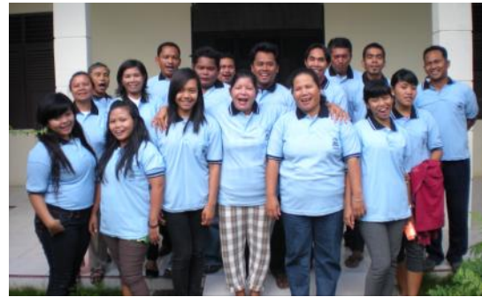
DRR Group from Simalingkar B, Medan | Timor-Leste Peduli Sesama untuk Pengurangan Resiko Bencana di Desa Simalingkar B, Medan