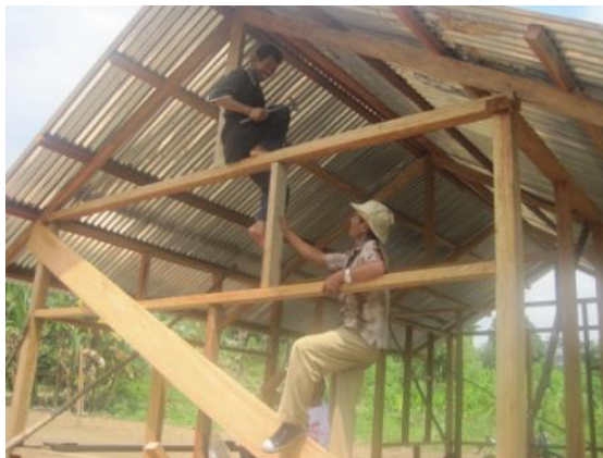
Sub village leaders of Pasibuat and Matoininit in Mentawai participated in the construction of information center | Kepala Dusun Pasibuat dan Matoininit di Mentawai turut ambil bagian dalam pembangunan posko informasi desa.

group, and the staff from Taikako Village office. All of the 25 people built the building together and completed the construction in only one month. These people not only gave their time and energy, they also contributed some materials such as: paint, bamboo, wood, and iron sheeting, while CDRM&CDS purchased other materials that could not be obtained locally," he added.