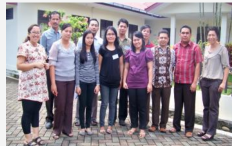
Finance Training in Simalingkar