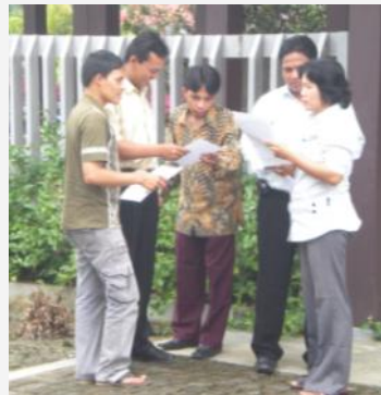
DRR Training in Simalingkar