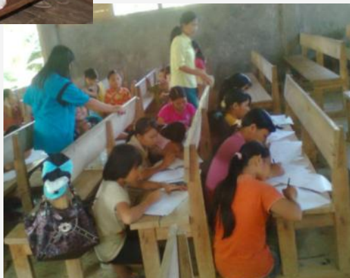
When there was no table, the participants of literacy session use church pews as their table duringKarena keinginan untuk maju, peserta Calistung menggunakan kursi gereja sebagai meja untuk belajar menulis