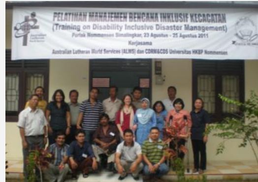
Disability Inclusive on DRR in Simalingkar