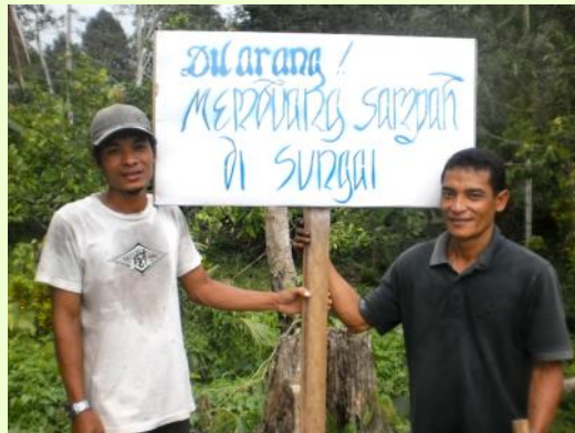
Village signage as the action plan from PHAST Training in Mabola, Mentawai | Papan pengumuman sebagai hasil tindak lanjut pelatihan PHAST di Mabola, Mentawai

CDRM&CDS played the role to establish or revitalize both LPM and Satlinmas, and equip them with skills and knowledge to manage and mitigate disasters. CDRM&CDS also equipped other community groups, such as volunteers, women, and youth, with knowledge to manage and mitigate disasters, also gave support the groups with mitigation activities, such as tree planting, simulation exercises, and environmental campaigns.