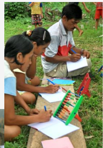
When the weather is nice, participants of literacy session like to have the session outside | Ketika cuaca cerah sering kali peserta kegiatan Calistung menginginkan kegiatan belajar diadakan di luar ruangan.