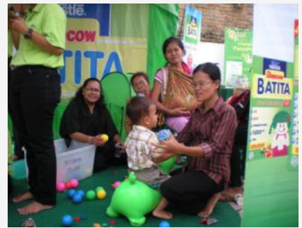
From Left: Community Health Center (CMH) Mawar in Simalingkar B, giving monthly health check for mother and children | Posyandu Mawar di Simalingkar B, memberikan pelayanan kepada ibu dan anak; CMH Kamboja, lead by village' Mid Wife, teach the children to wash hands properly | Posyandu Kamboja in Simalingkar B, bersama Ibu Bidan, mengajarkan anak-anak cara mencuci tangan dengan benar; Village Secretary and the wife of village leaders also participated in the nutrition orientation organized by CMH | Ibu Lurah dan Sekertaris Lurah ikut berpartisipasi dengan posyandu dalam orientasi tentang nutrisi