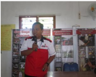
HIV/AIDS Workshop in Nias