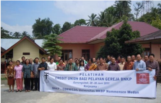
BNKP Credit Union Training