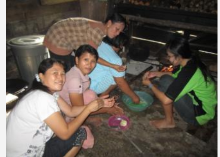
From Left: Training on making bamboo furniture for youth group in Malakopa, Mentawai | pelatihan pembuatan perabot dari bambu bagi kelompok karang taruna di Malakopa, Mentawai; Training on making crafts from plastic waste for youth group in Sikakap, Mentawai | Pelatihan membuat tas dari plastik bekas bagi kelompok pemuda di Sikakap, Mentawai; Training on making snacks and baking for women group in Onowaembo, Nias | Pelatihan membuat kue dan kudapan bagi kelompok ibu-ibu PKK di desa Onowaembo, Nias