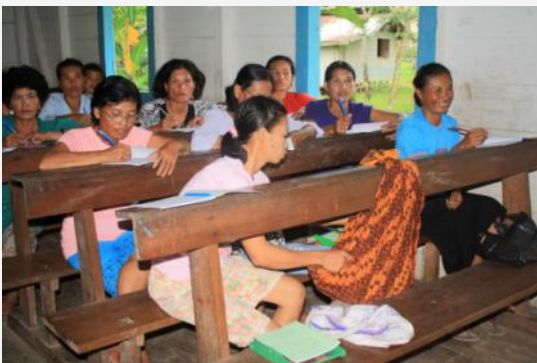
Literacy session in Bulakmonga, Mentawai | Suasana kelas calistung di Bulakmonga, Mentawai