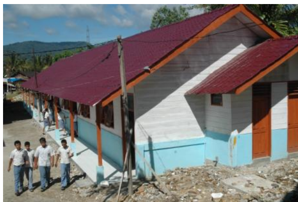
The newly constructed school building | Bangunan sekolah yang sedang dibangun di Sarulla