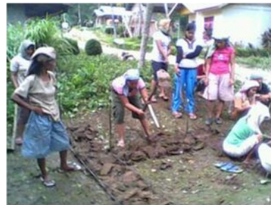
From Left: Members of women group received information from Bank Sumut | Anggota Kelompok Perempuan mendapatkan informasi dari Bank Sumut; | Members of women group were preparing the land for group vegetable farKelompok Perempuan sedang membuka lahan untuk pertanian