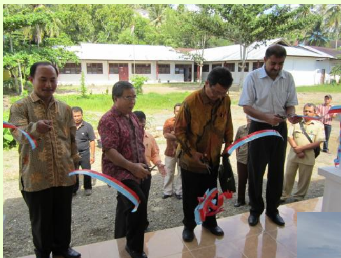
The new office building and training hall | Bangunan kantor dan ruang pelatihan di Nias

Pembangunan gedung pelatihan dan kantor di Nias di mulai di tahun 2010. Pembangunan tersebut selesai di kwartal ke dua. Peresmian gedung dilakukan oleh Gereja AMIN, Gereja BNKP, dan CDRM&CDS.