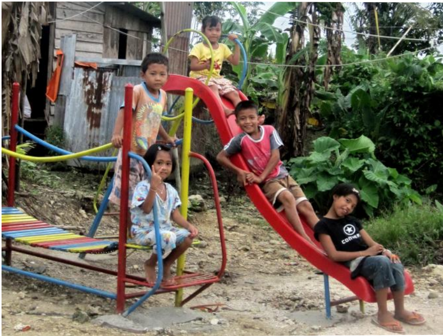
Children of Malakopa, Mentawai, happily playing on the playground | Anak-anak di Malakopa, Mentawai, dengan gembira bermain bersama