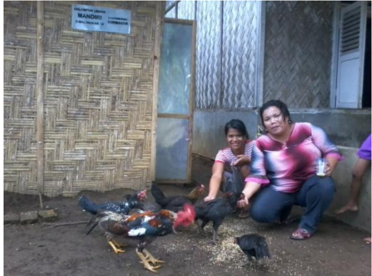
Mandiri Group, the small business Chicken Hatchery, in Simalingkar B, Medan | Kelompok Usaha Penetasan Ayam Mandiri di Simalingkar B, Medan

“Usaha ini dilakukan oleh CDRM&CDS dapat dimengerti dan sangat bermanfaat dalam memajukan desa.”