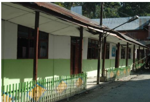
The inside and outside of the damaged school in Sarulla | Bagian dalam dan luar dari bangunan sekolah yang rusak di Sarulla