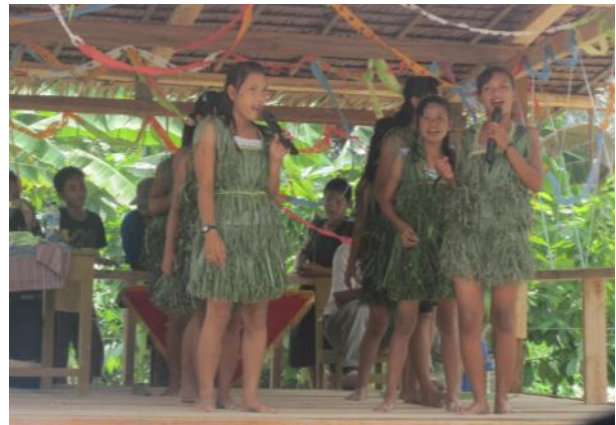
Local youth during the inauguration of the information center | Kaum muda setempat ketika peresmian posko informasi

Kegiatan pembangunan posko inipun dilaksanakan secara bergotong royong dengan cara swadaya yang dilakukan oleh anggota LPM, BPD, SATLINMAS, PKK dan Karang. Taruna serta Staff dari kantor desa Taikako. Gotong royong pembangunan diikuti sekitar 25 orang dimana kegiatan dilakukan secara bergotong royong