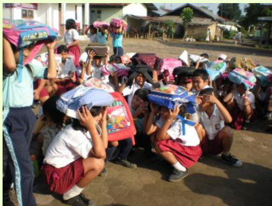
Simulation on earthquake for elementary students in Simalingkar B, Medan | Simulasi gempa dengan murid-murid Sekolah Dasar di Simalingkar B, Medan

CDRM&CDS berperan dalam merevitalisasi atau mengaktifkan kembali LPM dan Satlinmas di desa-desa, dan melengkapi keduanya dengan pengetahuan dan keterampilan untuk mengelola dan mitigasi bencana. CDRM&CDS juga membekali kelompok masyarakat lainnya, seperti sukarelawan, kaum wanita dan pemuda, dengan pengetahuan untuk mengelola dan mitigasi bencana. CDRM&CDS juga mendukung kegiatan kelompok tersebut, seperti: penanaman pohon, simulasi, dan kampanye lingkungan.