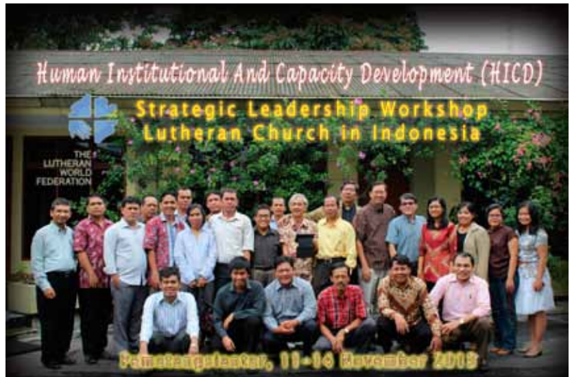
Human and Institutional Capacity Development Strategic Leadership Workshop.

Training supports (scholarships) were designated for select member churches