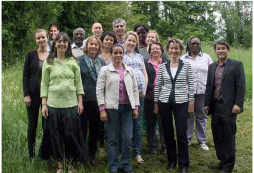
LWF DMD Team.

Accompaniment with member churches through project work has been an important dimension of our work. This year we were involved with project work in 108 member churches in 45 countries. While each project has a unique flavor, the continuous thread of focused accompaniment can be clearly seen. One of the reports notes that: "Projects...are like lights that will shine in the midst of dark realities and contexts..." What a joy it is to participate