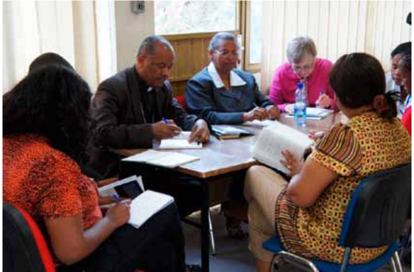
Gender Justice and Mainstreaming Workshop in Addis Ababa, Ethiopia, February 2013.

In December a group 15 women from the LWF regions came together under the theme “Women Mentorship.” Three main areas of focus were leadership, on-going reformation and project work. The workshop was done in collaboration with Department for Theology and Public Witness and brought together women theologians, church leaders and those working in projects facilitated by LWF. The major outcome of the workshop was sharing knowledge and experience with one another other which strengthened