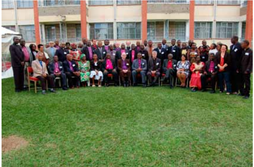
African Lutheran Church Leadership Conference 2013

The LWF Council approved a document to guide the work around Good Governance and Comprehensive Capacity Development . It shared criteria for good governance in member churches and emphasized the importance of grounding criteria in theology and practice with mutual engagement of member churches. DMD gave limited support to churches needing accompaniment in organisational and administrative renewal processes in Africa and Middle East, but most activities were on hold due to a staff vacancy.