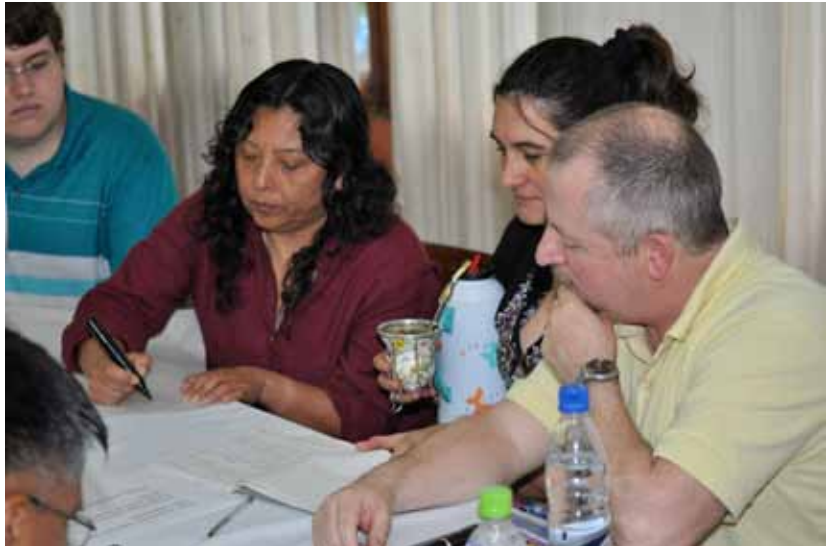
Working group on the terms of reference -Sustainability Program LAC.

Two international seminars at the LWF Wittenberg Center, offered opportunities for 38 pastors to study Lutheran theology and experience the communion of the LWF at the cradle of the Reformation. The seminars combined studying Luther