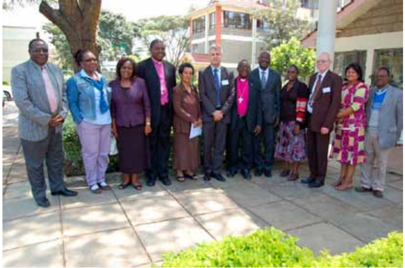
African Lutheran Church Leadership Conference 2013

In 2013 the LWF accompanied several member churches as they dealt with challenges of conflict and