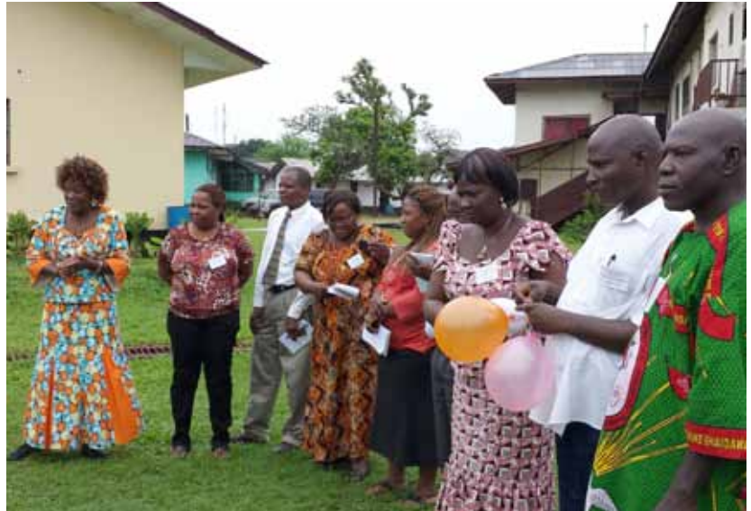
Preparing for an exercise on protection issues in Monrovia, 1.11.2013

In addition, the program concentrated on the added value of churches. Churches reflected on their theological and biblical resources, such as biblical narratives