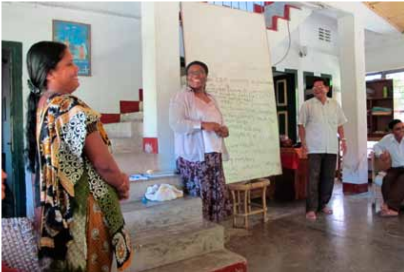
Workshop and Assessment on Diakonia, Bangladesh

Recently some areas in the South East Asia region have been affected by increased natural disasters such as floods, typhoons and earthquakes. The Philippines, Cambodia and Myanmar are most affected. The Asia Desk assisted in fund-raising and coordination of the relief work by connecting member churches to Department for World Service (DWS) and other local partners. Visits were made to some affected areas to as-