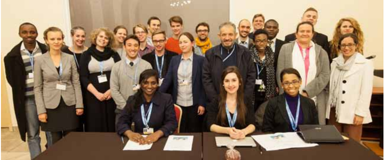
The LWF Delegation invited the Interfaith Youth Network to discuss Advocacy for Climate Justice at COP19.

and powerful advocacy work for the poor and vulnerable.