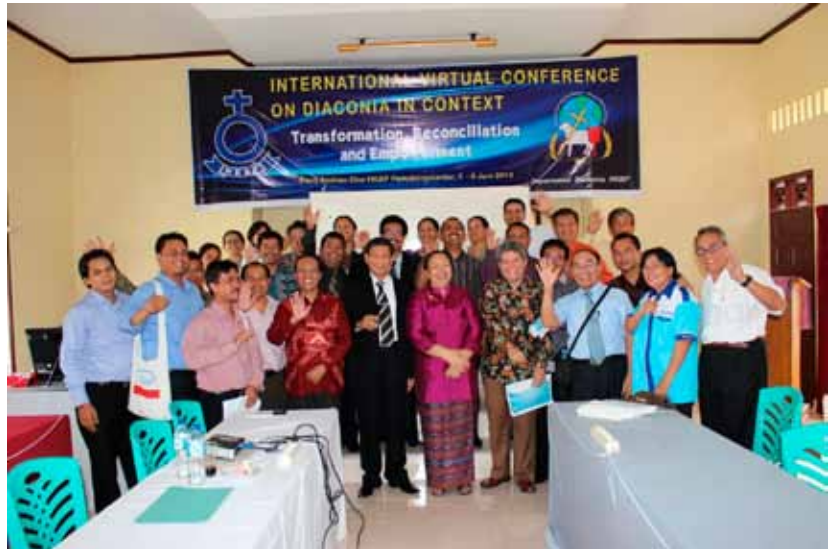
Group of participants from the HKBP in Indonesia, at the end of the LWF Virtual Conference for Diakonia.

A key question asked immediately after the conference was whether