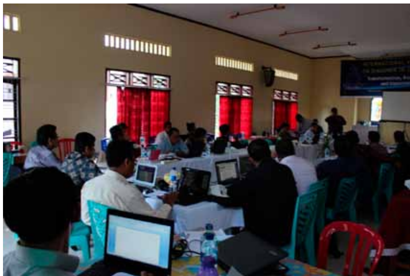
Group of participants from the HKBP in Indonesia, attending the LWF Virtual Conference for Diakonia.

Focused accompaniment, including visits and specific training in 21 small and struggling LWF Member churches in Asia, Africa, Latin America and Europe, enabled churches to increase their capacity to meet the project planning, monitoring and reporting requirements.