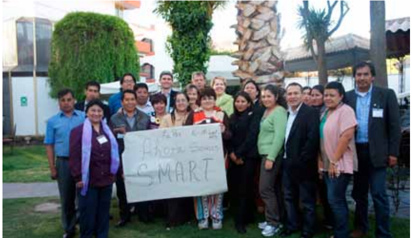
"Now we are S.M.A.R.T." regional project management training in Bolivia, La Paz.

The DMD PIM desk worked with 108 member church projects in 45 countries in 2013. Project work involved member churches from all 7 regions, either as project holders or as supporting organizations. The focus of member churches' project work was on diakonia, theological education, sustainable development, capacity building, HIV and AIDS, women empowerment and church institutional development.