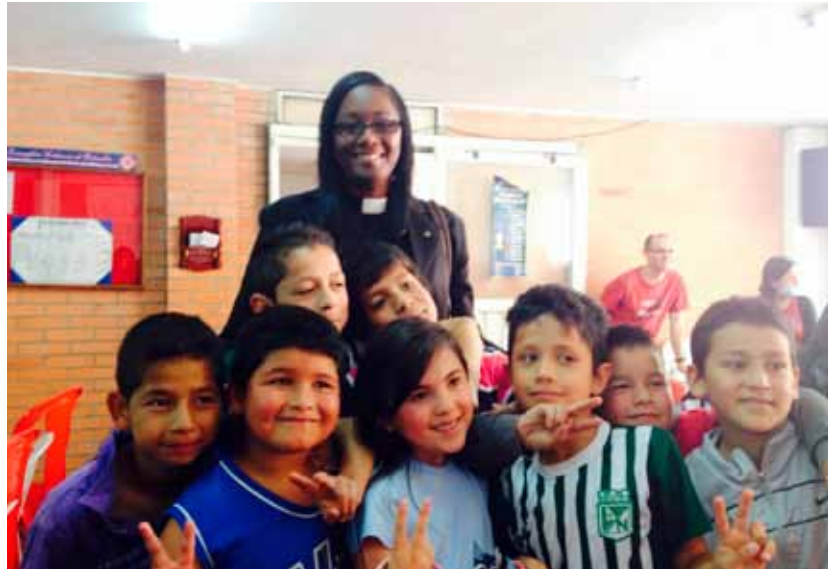
Children from the Castillo Fuerte congregation ready to perform.

Bangladesh Lutheran Church was founded in 1968 by Lutherans from North East India. In 1979 it became an independent Bengali congregation known as Bangladesh Lutheran Church. It began with 40 members and today has 150 congregations and a membership of