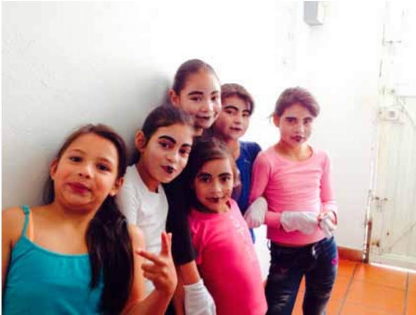
Caring for children's rights, Iglesia Evangélica Luterana Castillo Fuerte

water, and good use of governments’ budgets. The holistic approach to transform communities will be developed through programmatic plans on food security, environmental stewardship, institutional sustainability, and good governance.