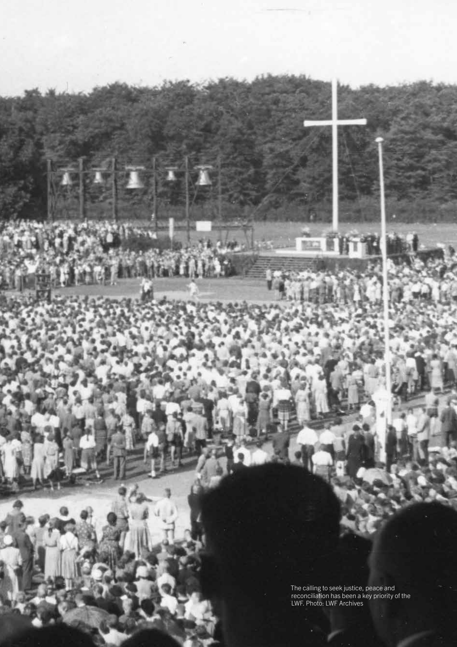
The calling to seek justice, peace and reconciliation has been a key priority of the LWF.