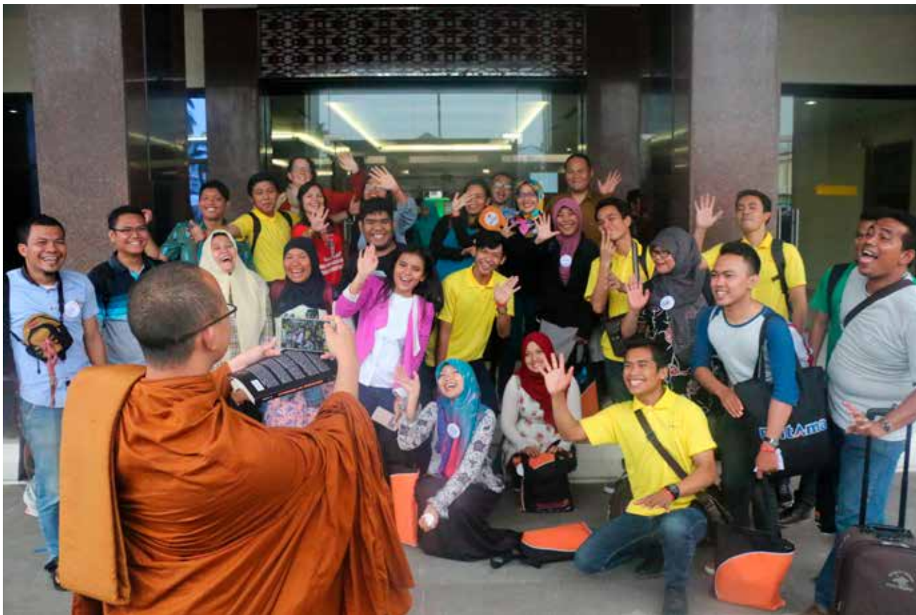
Participants in an LWF-supported interfaith project targeting youth in Indonesia.

their local and national governments in the push for climate policies and actions. In addition, advocacy dialogues, education, and awareness campaigns will target youth and learning institutions. The LWF will take part in collaborative advocacy campaigns and mobilization with other churches, faith-based organizations, and civil society. Climate justice advocacy will be implemented by LWF World Service country programs, especially when it relates to humanitarian operations and livelihood programs.