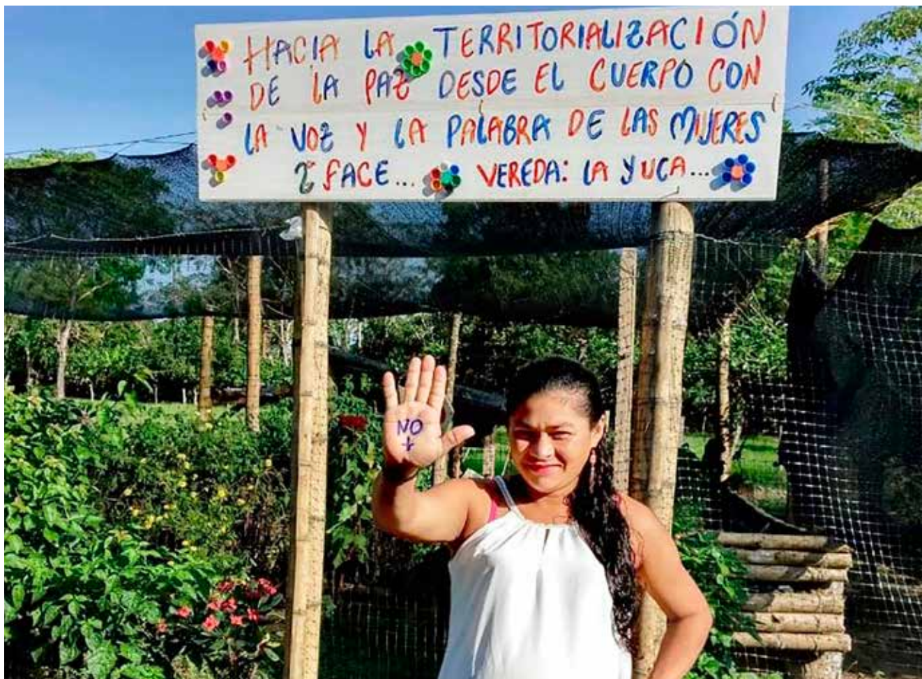
In Arauca, Colombia, LWF combines human rights' education and livelihoods' support to empower women.

stakeholders that the human rights of women and girls have been further eroded.