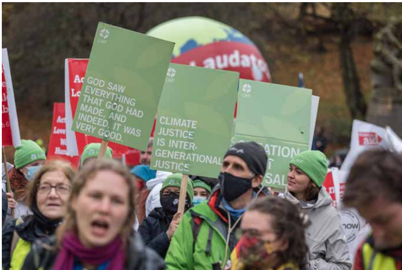
LWF's delegates join in climate justice advocacy at the COP 26 in Glasgow, Scotland.

Youth-led advocacy, mobilization, and engagement in climate action, including as the main LWF delegation to the Conference of the Parties (COP) to the UNFCCC, remains a strategic priority for LWF climate